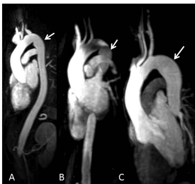
Figure 2. Three-dimensional reconstruction of magnetic resonance angiography images of patients III:4 (A), III:6 (B) and III:8 (C) in Figure 1, showing peculiar mild narrowing at the level of the isthmus and post-isthmus aortic ectasia (arrows).

Abbreviations: ADil, aortic dilatation; ADis, aortic dissection; Asp/H, arm-span-to-height ratio; F, female; FacF, facial features; JointH, joint hypermobility; M, male; MVP, mitral valve prolapse; na, not available; PAcet, protusio acetabulae; PCar, pectus carinatum; PExc, pectus excavatum; PPlan, pes planus; Scol, scoliosis; Surg, surgery; W&T, wrist and thumb signs; –, not present; +, present.