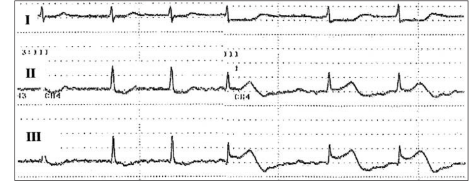
Fig. 1. Electrocardiography monitor recording that shows the ST segment elevation in derivations II and III.

The transitory elevation of the ST segment in the inferior derivations has been described as a rare complication during the percutaneous closure of IAC with the Amplatzer device, and it has been attributed to the possible embolization of small air bubbles.<sup>4</sup> This complication has been observed more frequently during other non-coronary percutaneous procedures, specifically mitral valvuloplasty (MVVP) with Inoue balloon. Vahanian et al<sup>11</sup> described this finding in 2.6%of MVVP procedures; it was observed upon deflating the balloon, and attributed it to air embolisms introduced into the right coronary artery, given the high location of the right coronary ostium in relation to the left in the decubitus supine position. In all cases, right coronary angiography was normal. Ludman et al<sup>12</sup> described this complication in a greater percentage of valobserving vuloplasties (7.4%), the elevation immediately before the balloon traversed the mitral valve, so that they considered it unlikely that an air embolism was the cause. These authors postulated the possible existence of ischemic or mechanical changes, or both (coronary spasm, deformation of the AV furrow, etc.) caused by the manipulation of rigid cathe-