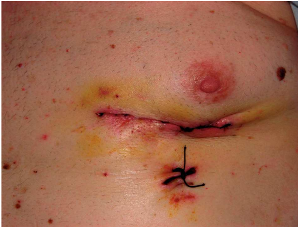
Figure 1. Skin incision of the anterolateral thoracotomy.

The procedure was performed in the operating theater, with fluoroscopic and 3-dimensional transesophageal echocardiographic guidance. With the patient under general anesthetic, the apex of the left ventricle was approached via an anterolateral minithoracotomy (Figure 1). With the patient in the theater, the exact site of incision was located using transthoracic echocardiography. After opening the pericardium, the surgeon performed a purse-string suture in the apex through which the different catheters were subsequently introduced. After advancing the guidewire to the abdominal aorta, aortic valvuloplasty was done with conventional balloon procedure through a 14 Fr introducer. Subsequently, the introducer was changed for a 33 Fr one, through which the system for implantation of the aortic bioprosthesis (Ascendra) was introduced. Both the valvuloplasty and implantation were done in ventricular tachycardia induced by epicardial pacing at 160-200 beats/min. If moderate or severe aortic valve regurgitation was observed after implantation, redilatation was done before withdrawing the device. After confirming the function and position of the prosthesis (Figure 2), the device was withdrawn and closed in standard fashion leaving a chest drainage tube in the pleural cavity. The bioprosthesis only required antiaggregant prophylaxis with aspirin.