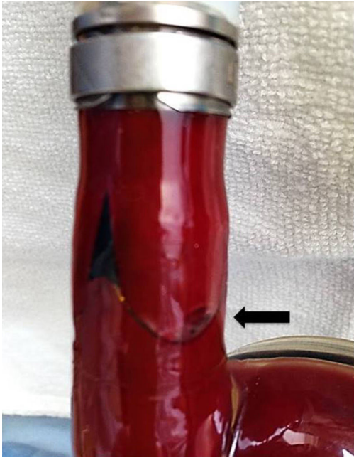
Figure 1. Red thrombus in the PUV of the EXCOR ® (arrow).

hypertension. However, in the context of a change to heparin, the patient developed an ischemic stroke. Red thrombi were seen in the sinuses of the PUVs (Figure 1). The EXCOR ® LVAD was replaced by a CentriMag ® LVAD without re sternotomy using the EXCOR ® cannulas. One week later, without neurological deficit, the patient was included on the urgent HT list. However, we observed white fibrin deposits in the adaptor that connected the EXCOR ® and CentriMag ® cannulas (Figure 2). Seventeen days after inclusion on