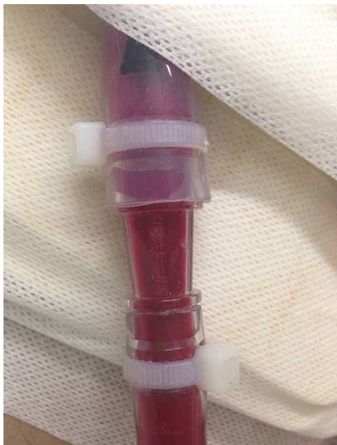
Figure 2. Connection between EXCOR ® and CentriMag ® cannulas.

hypertension. However, in the context of a change to heparin, the patient developed an ischemic stroke. Red thrombi were seen in the sinuses of the PUVs (Figure 1). The EXCOR ® LVAD was replaced by a CentriMag ® LVAD without re sternotomy using the EXCOR ® cannulas. One week later, without neurological deficit, the patient was included on the urgent HT list. However, we observed white fibrin deposits in the adaptor that connected the EXCOR ® and CentriMag ® cannulas (Figure 2). Seventeen days after inclusion on