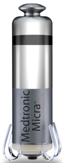
Figure 2. Micra transcatheter leadless pacemaker.

LEADLESS II 4 is a prospective registry of patients with an indication for single-chamber pacing who received a Nanostim device. This registry included more than 500 patients and evaluated efficacy and safety parameters at implantation and, in the first 300 patients, at 6 months postimplantation. This pacemaker was implanted successfully in 95.8% of cases. At follow-up, the rate of device-related adverse events was 6.7%: these included increased pacing threshold, cardiac perforation, arrhythmias, emboli, and vascular access problems. Total mortality was 0.44%. The authors concluded that, in the study, implantation was successful in most patients and the complications rate was 1 in 15 patients.