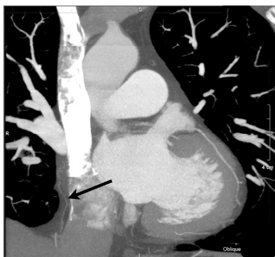
Figure 1. Coronal reconstruction using maximum intensity projection showing the course of the right pericardiophrenic artery through the pericardial fat.

The most serious complication of PV ablation is probably total or partial diaphragmatic paralysis due to phrenic nerve injury. This is more common during a cryoballoon isolation procedure (4%-10%) 5,6 than during radiofrequency ablation (0.10%-0.48%). 7 Although it is usually reversible (80% per year), 7,8 very symptomatic patients have been described. 9 The RPN runs close to the RSPV and the superior vein cava. 10 Their ablation carries a high risk