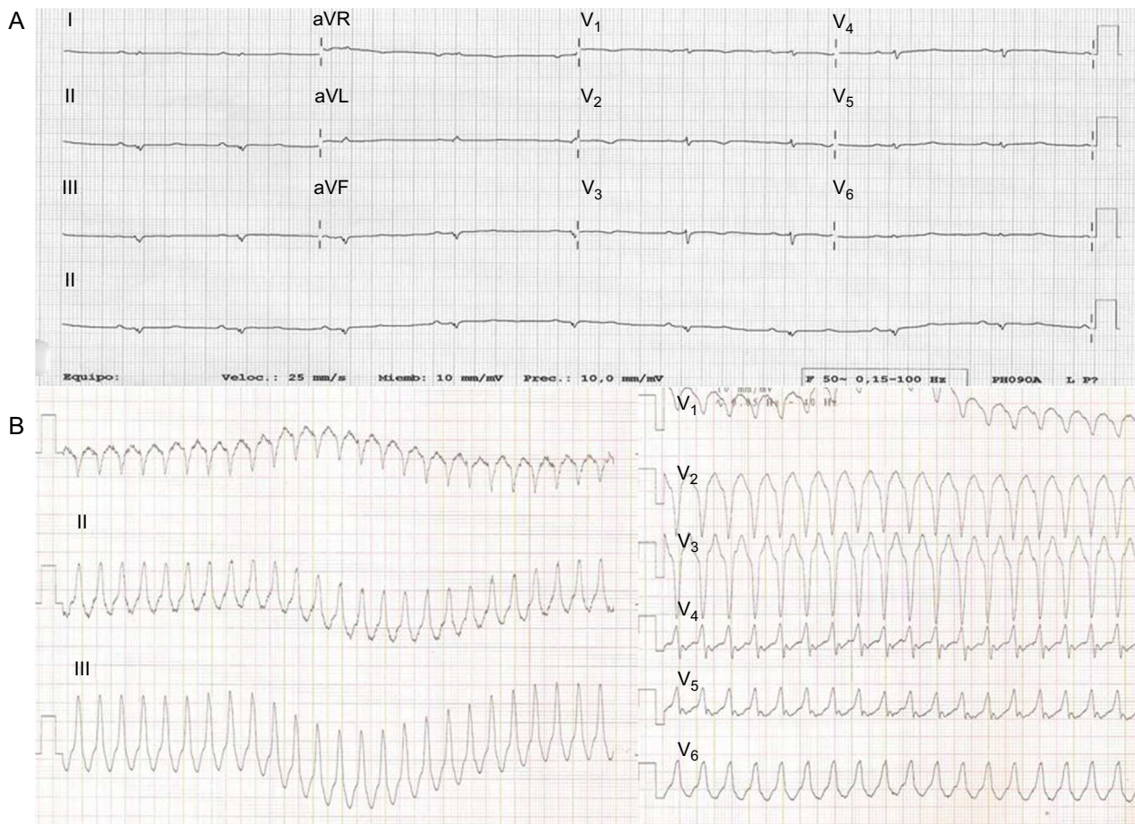
Figure 2. A: The proband's electrocardiogram. Notice the strikingly low voltages throughout and inverted T waves in right precordial leads. B: Sustained ventricular tachycardia suggestive of a right ventricle outflow tract origin.

Due to the morphology of ventricular tachycardia and ECG abnormalities and their status as carriers, 2 patients met the criteria for definitive arrhythmogenic right ventricular cardiomyopathy whilst 3 had a borderline diagnosis.