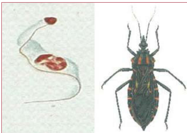
Figure 2. Trypanosoma cruzi (aetiological agent) and vinchuca (vector), taken from the figures published in the original article by Dr Carlos Chagas in 1909.

field studies and the use of ECG as a tool for distinguishing between health and illness. Concrete measures are taken to counteract it.