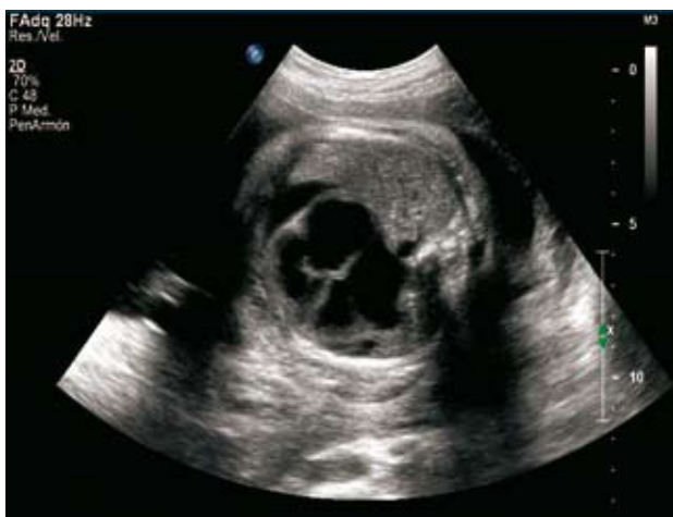
Figure 1. Prenatal echocardiography with pericardial effusion.

out. A cardiologic study was performed and a Wolff-Parkinson-White (WPW) type pre-excitation was found in the electrocardiogram (Figure 2). No pericardial effusion was found on echocardiography, but a moderate to severe tricuspid insufficiency and mild myocardial dysfunction (ejection fraction, 55%; shortening fraction, 27%) were observed. Neonatal treatment was initiated for the tachycardiomyopathy with furosemide and digoxin. The patient remained stable, with a normal heart rate, at all times, and there was an improvement in the functioning of the left ventricle.