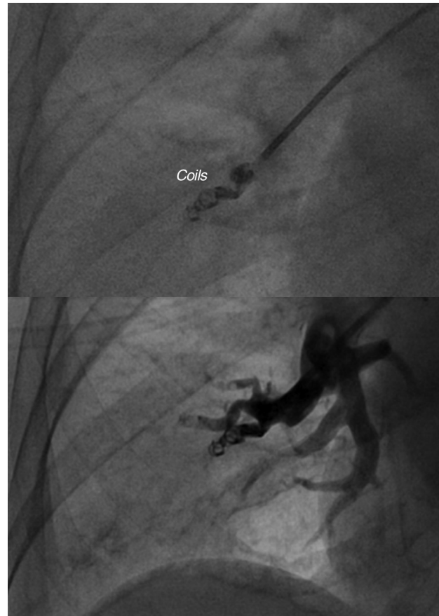
Figure 2. Coils in pulmonary artery branch with absence of contrast path.

the lower right lobe artery was embolised using coils, due to the possibility of repermeation and delayed bleeding. The procedure was successful and there were no complications (Figure 2).