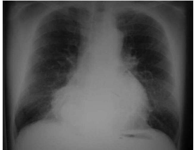
Figure 1. Chest X-ray: there is evident deformity of the cardiac silhouette, with well-defined smooth edges, in the right chambers.

We present a 54-year-old man who underwent chest radiography in the context of a respiratory infection. As an incidental finding, a well-defined cardiac contour deformity with smooth edges was detected in the right chambers (Fig. 1). Echocardiography was performed and showed a cystic appearance with partially calcified borders located on the underside of the cardiac silhouette. Function was not compromised. The study was continued using computed tomography of the thorax with contrast. The results showed a large cystic mass in the anterior mediastinum with a right para-cardiac and infracardiac location and extensive calcification of the wall, probably accompanied by pericardial calcification around the left ventricle (Fig. 2A). Magnetic resonance imaging revealed a large cystic intrapericardial image attached to the bottom of both ventricles without infiltration, with proteinaceous content and round images in the interior (Fig. 2B). We concluded that the image