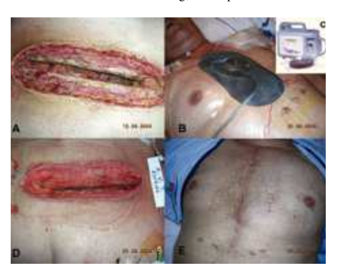
Figure. A: mediastinitis: acute phase. B: the vacuum assisted closure system in place. C: continuous aspiration apparatus. D: granulation phase 5 days after vacuum assisted closure. E: definitive cure 40 days later.

Vacuum assisted closure (VAC) was first used in 1997 in plastic surgery, and the results were spectacular. We successfully used this technique in a 52 year-old man following surgical debridement to treat post-transplant mediastinitis (Figure, A). The system used (VAC®, KCI Clinic Spain, S.L.) involves placing a polyurethane sponge in the chest wound and covering it with a plastic adhesive (Figure, B). The area is then hermetically connected to a continuous aspiration system (Figure, C). The sponge is changed every 48 h. The negative pressure developed must be between 125 and 200 mm Hg; lower pressures are inef-