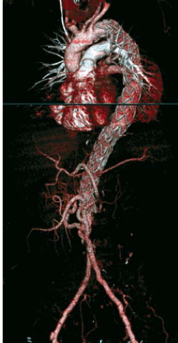
Figure 2. Debranching of right renal arteries, superior mesenteric and celiac trunk in a patient with only 1 kidney and a prior bifurcated graft.

The mean intensive care unit stay was 5 (6) days (range, 2-28) in group A and 4 (3.2) days (range, 1-10) in group B. The mean hospital stay was 18