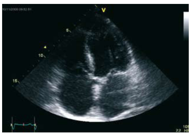
Figure 2. Apical four-chamber echocardiography showing hypertrabeculation in the middle segment of the anterolateral wall and apex, with a thickness 2 times greater than that of the compacted layer.

in more than one case within the same family. Both siblings were diagnosed with hepatorenal polycystosis and cardiac abnormalities which met criteria for NCC.