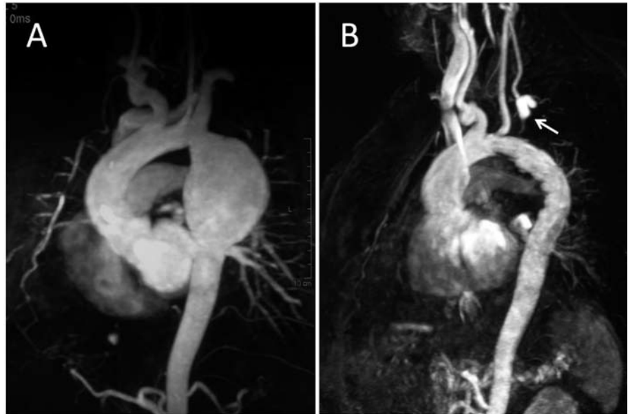
Figure 2. Case 3. Magnetic resonance. A: large aneurysm after the origin of the left subclavian artery. B: after the procedure; the origin of the left subclavian artery is occluded by the graft and the vessel is filled through the left carotid artery (arrow).

diameter of the aorta remained unchanged (15 mm) (Figure 1). The outer diameter of the segment of healthy distal aorta was equal to that observed in the area of greatest stenosis (15 mm).