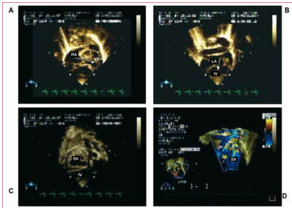
Figure 2. Two-dimensional color echocardiography of Patient 5, in subcostal view. A: right atrium (RA) connected to a superior ventricle (SV). B: left atrium (LA) connected to an inferior ventricle (IV), with atrioventricular concordance. C: superior ventricle (SV) and inferior ventricle (IV). D: double-outlet superior ventricle (SV) with right-sided aorta (Ao) and left-sided pulmonary artery (PA).