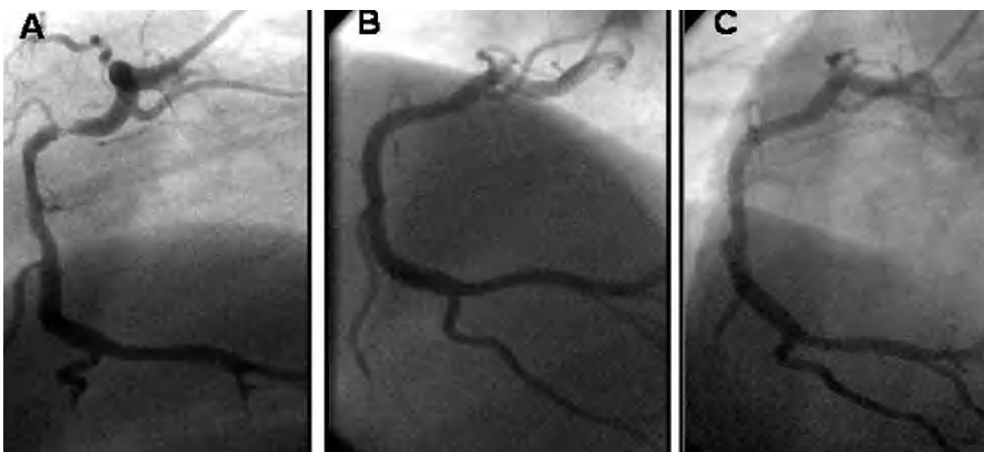
Figure 2. A: severe lesion in the middle right coronary artery. B: immediate direct postimplantation of a 4×15-mm Driver stent. C: angiographic control at 6 months' follow-up.