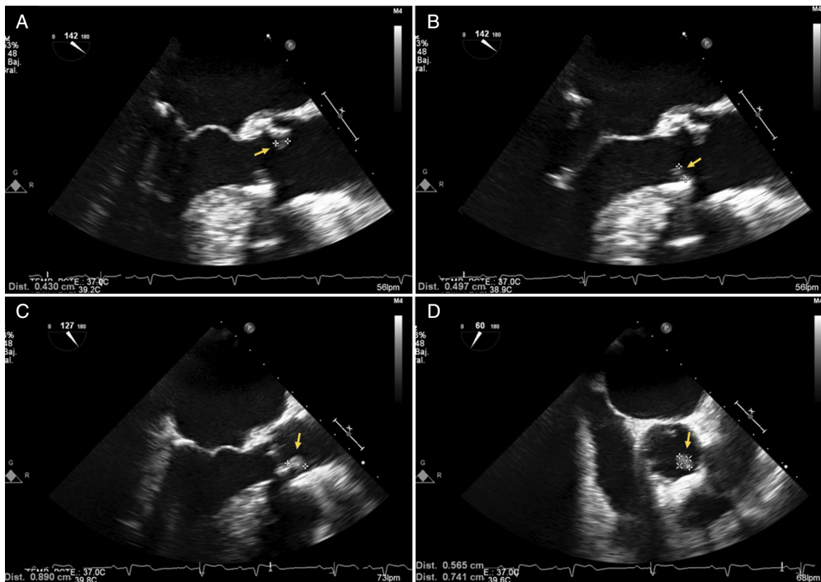
Figure 1. A and B, Transesophageal echocardiograms depict 2 mobile images (arrows) on the ventricular aspect of the aortic valve, corresponding to vegetations. C and D, The follow-up examination shows an increase in size (arrows) and an absence of periprosthetic complications.

uptake that did not suggest IE (Figure 2), although the patient already fulfilled some of the IE criteria (1 major and 3 minor).