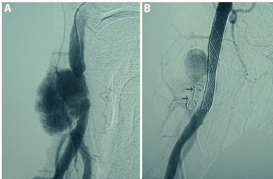
Figure 3. A: Arteriography of Case 5. Pseudoaneurysm in the right superficial femoral artery. B: Case 5. The aneurysm has disappeared following percutaneous placement of a femoral endoprosthesis. Coils in the deep femoral artery (arrows).

the pseudoaneurysm (Figure 3A and B). Local infection persisted and echo-Doppler demonstrated a periprosthetic collection (Figures 2B and C). The patient underwent surgical drainage and removal of the abscessed hematoma with a second attempt at closure. Antibiotic treatment with cloxacillin was given for 3 weeks followed by oral levofloxacin (500 mg/24 h) plus oral rifampicin (300 mg/12 h) for 1 additional week. Culture of the resected material yielded S aureus .