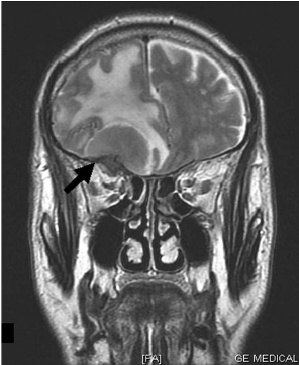
Figure 2. Cerebral MRI. T2-weighted coronal view showing the meningioma (arrow) and the significant accompanying oedema that caused the disappearance of the ipsilateral sulci and subfalcine herniation.

hypertension induced by the mass and its oedema. Indeed, the bradycardia associated with intracranial hypertension (Cushing's effect) due to secondary medullary ischemia in severe cases, is well-known.