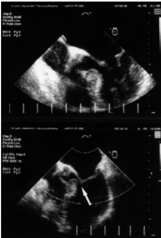
Fig. 1. Images of transesophageal echocardiography, diastole (upper image) and systole (lower image), in which hypertrophy of the basal septum and displacement of anterior leaflet of the mitral valve obstructing the LVOT (arrow) can be appreciated.

drugs (dopamine, epinephrine, dobutamine) or intra-aortic balloon counterpulsation, is contraindicated. Consequently, treatment is based on the use of drugs that reduce the gradient, like beta-blockers, pure alpha agonists, methoxamine, or phenylephrine, while volume depletion and the use of vasodilators is avoided. 4