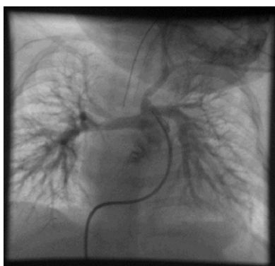
Figure 1. Pulmonary arteriogram in the posteroanterior projection in which the origin of the pulmonary trunk through the ductus arteriosus of the left brachiocephalic trunk is visualized.

The anomalous origin of the left brachiocephalic trunk at the level of the pulmonary trunk is an infrequent vascular malformation. Only 5 cases have been described in the literature, and these always have had the origin in the common carotid artery in the main pulmonary artery, 1 but not the brachiocephalic trunk as in