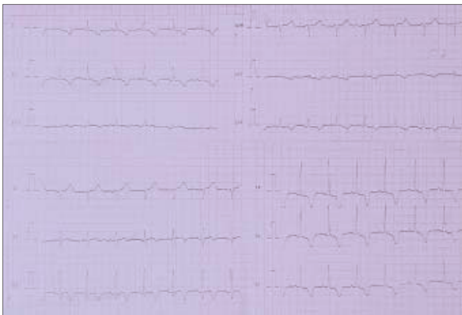
Fig. 2. Electrocardiogram of the same patient after treatment.

leukopenia, alopecia, and cerebella ataxia.