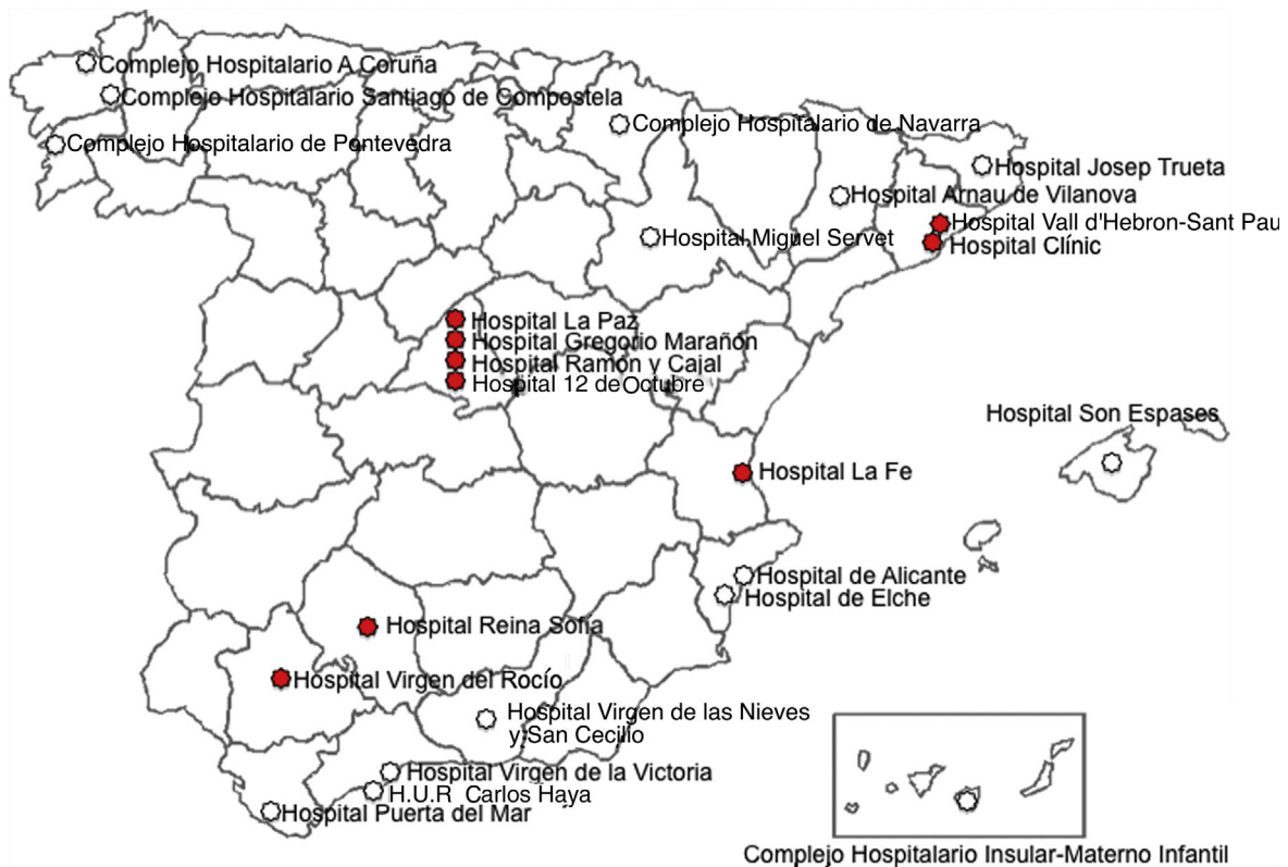
Figure 1. Distribution of centers with specific activity in adult congenital heart disease in Spain. Filled circles indicate the national Centers, Services, and Referral Units (CSURs).

excluded from the analysis and 24 centers participated in the survey. There were 6 centers in Andalusia, 4 in Catalonia, 4 in the Community of Madrid, 3 in Galicia, 3 in the Valencian Community, 1 in the Chartered Community of Navarre, 1 in Aragon, 1 in the Balearic Islands, and 1 in the Canary Islands. There were no centers in the other autonomous communities (figure 1). Of the 24 centers, 9 have been recognized as Centers, Services and Referral Units (CSURs) by the Spanish National Health System. Figure 2 shows the year in which ACHD health care was initiated in the 24 centers. In 2005, only 5 centers met the requirements for specific care. After this year, there was a steady increase in their number.