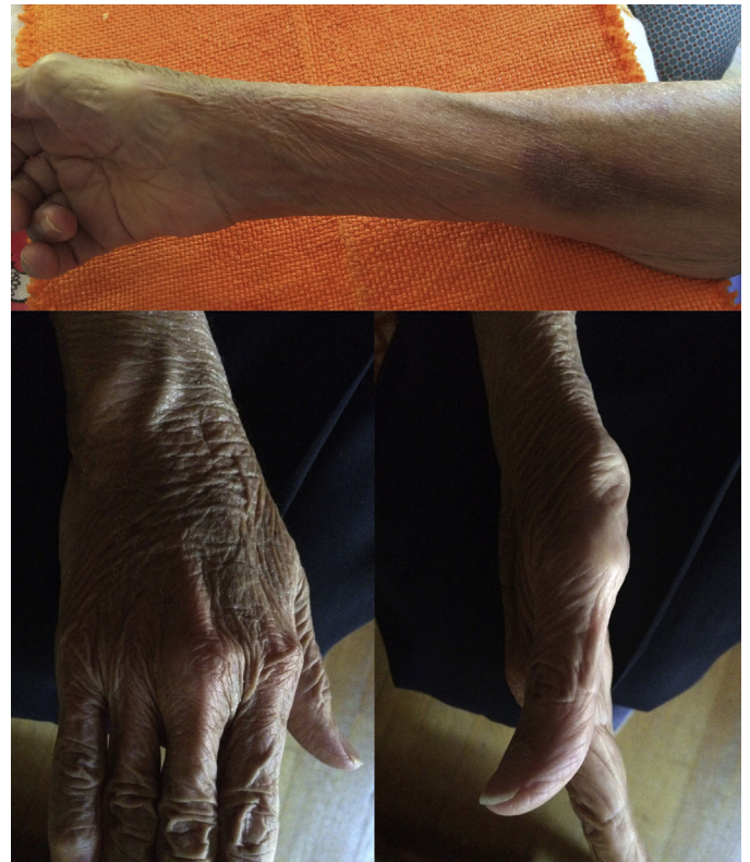
Figure 2. Hand and forearm 3 weeks later; virtual symptom resolution (except for mild persistent ecchymosis in the forearm).

The radial artery was then compressed 3–5 cm proximal to the PS (in an area without hematoma). Although the compression stopped the progression, the tension edema persisted and there was no improvement in symptoms. Thus, we empirically decided to use a scalpel to extend the initial PS, which produced a gush of nonpulsatile blood (Figure 1B and Figure 1C). After 2 minutes of drainage, the signs and symptoms progressively disappeared. The procedure was finalized by compressing the PS (now hematoma-free) with a pneumatic device. The clinical course in the next 3 weeks was excellent and without sequelae (Figure 2).